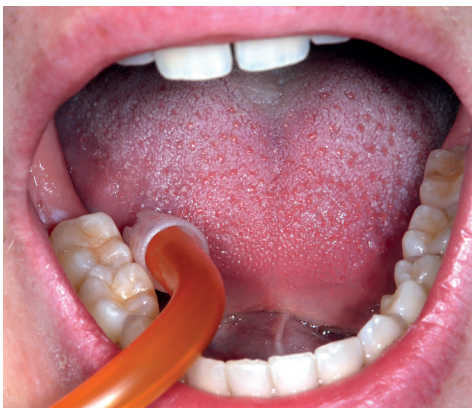
Position of the saliva ejector lingually