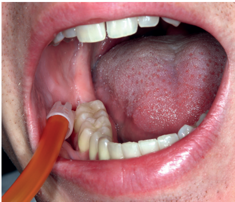
Position of the saliva ejector buccally

Saliva Ejectors are used for almost every procedure. The working area is kept free from saliva, blood and other fluids and remains as dry as possible.